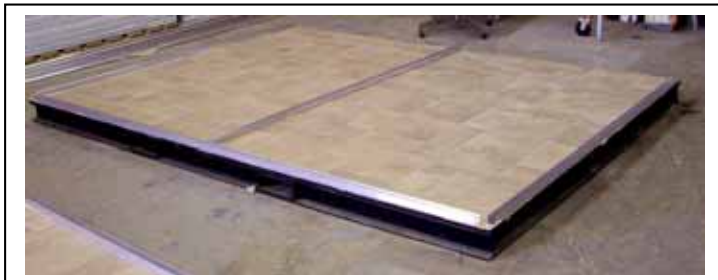
Two Stall Building with Non-Skid Linoleum and U Channels Bolted to Steel Frame