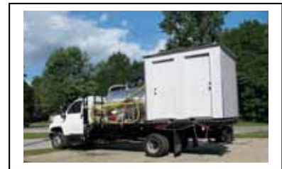
Emergency Mobile Sanitation System As Required