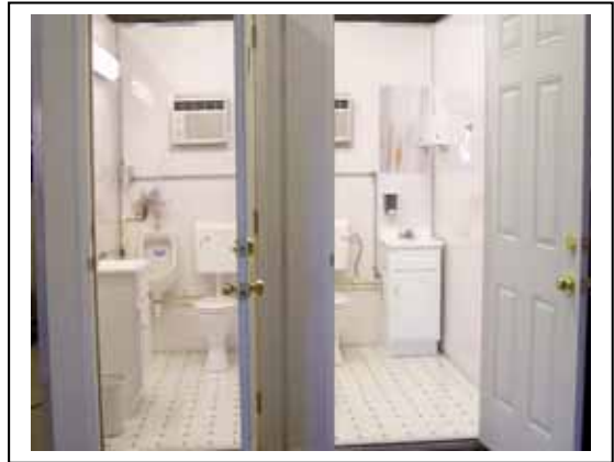
Men's and Women's Stalls