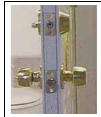
Door Locks/Deadbolt Locks