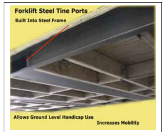
Steel Floor with Tine Ports