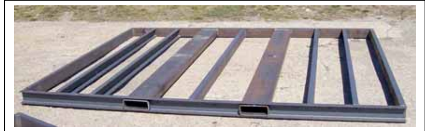
Two Stall Building Steel Frame with Fully Encased Steel Tine Ports for Maximum Mobility for Relocation or Natural Disasters