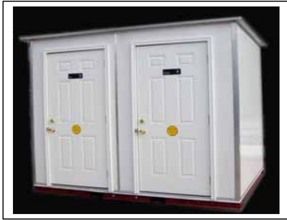
Typical 2 Stall Building