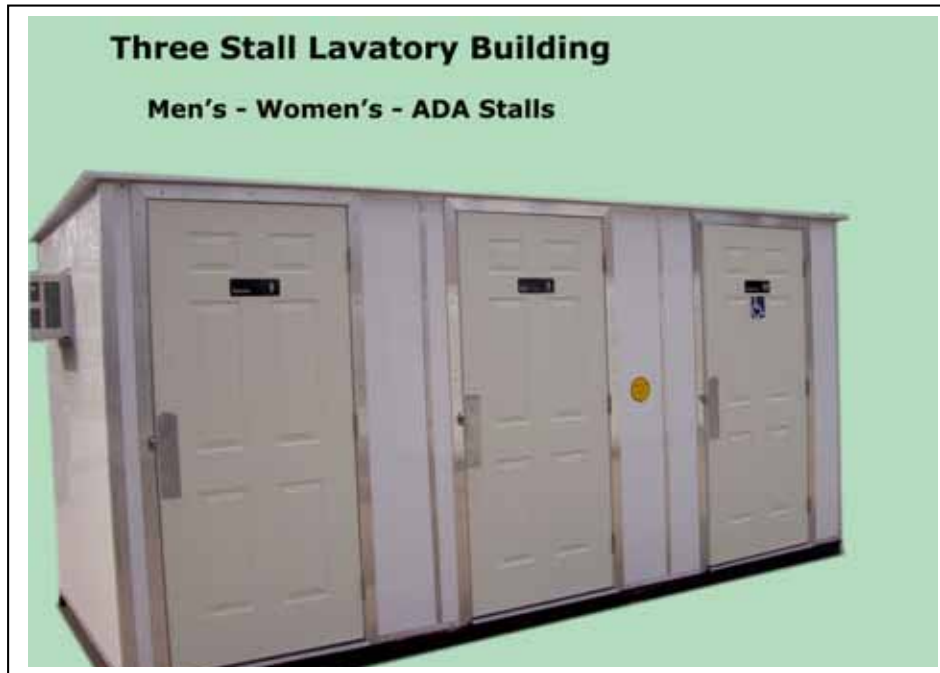
Men's – Women's – ADA Three Stall building